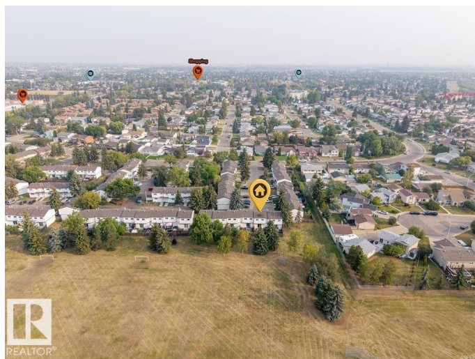
2551 135 Ave NW, Edmonton, AB