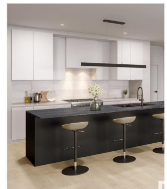
UPGRADE HOOD FAN BUILD OUT VANILLA / FLAT PANEL