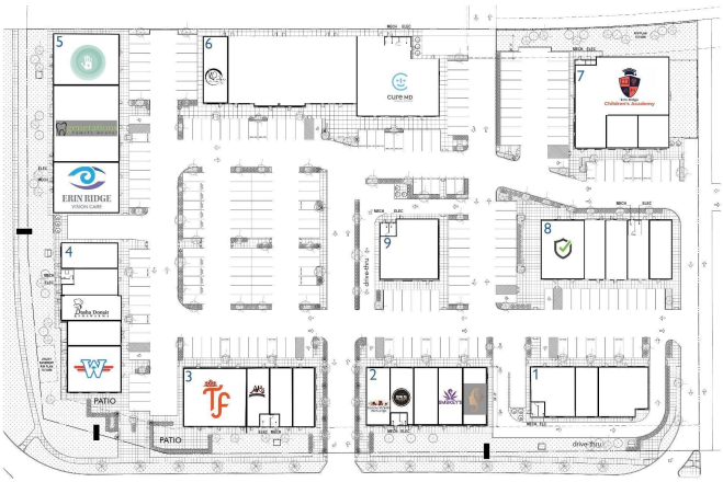
■ Pylon Sign