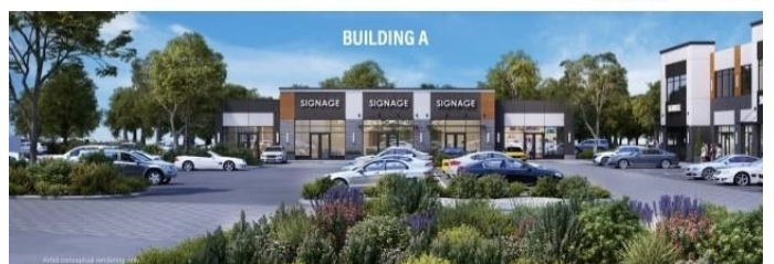
BUILDING A AVAILABILITY